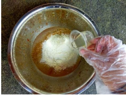
7. Tambahkan vanilli