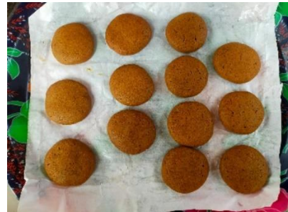
14. Angkat cookies dan dinginkan