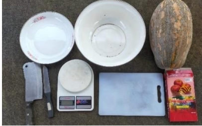
1. Persiapan alat dan bahan