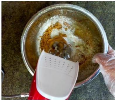
9. Dicampurkan dengan mixer kecepatan rendah selama 1 menit