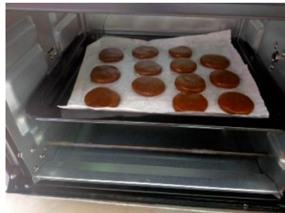
12. Cetak adonan dan letakkan dalam Loyang