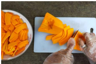
5. Pemotongan menjadi bagian kecil - kecil