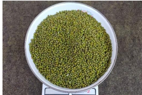
2. Penyortiran / Pemilihan Kacang Hijau