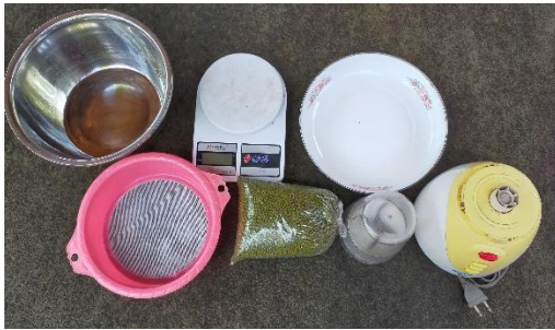
1. Persiapan alat dan bahan