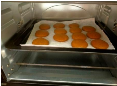
13. Oven dengan suhu \pm 150°C selama \pm 20 menit