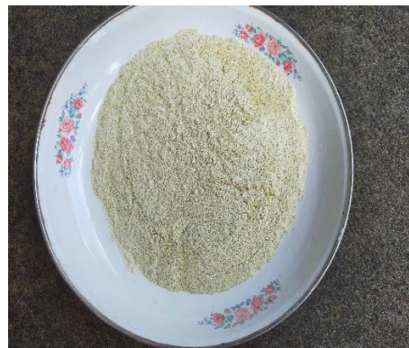
8. Tepung Kacang Hijau