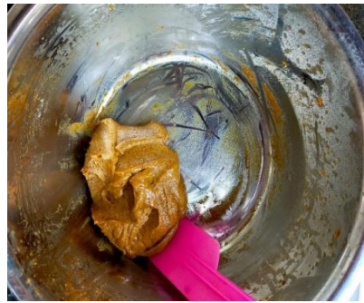
10. Kemudian, aduk menggunakan sendok selama \pm 5 menit