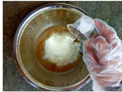
8. Tambahkan baking powder