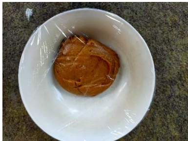
11. Masukkan ke dalam kulkas selama 30 menit